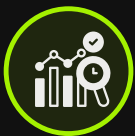
Market Data Analysis

The system operates 24/7, continuously optimizing performance.