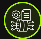
Machine Learning Models